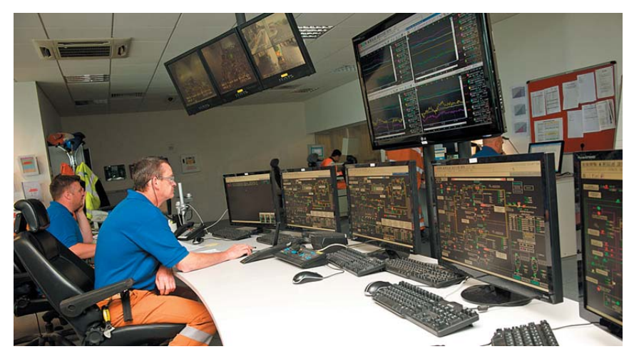
Central control room

With the integration of the Yokogawa CENTUM CS 3000 and ProSafe-RS systems, operators in the central control room enjoy ready access to operations throughout the plant. Ergonomically designed CS 3000 human interface stations (HIS) provide a window into all of this facility's processes, giving operators real-time access to all the information they need to make quick and timely decisions.