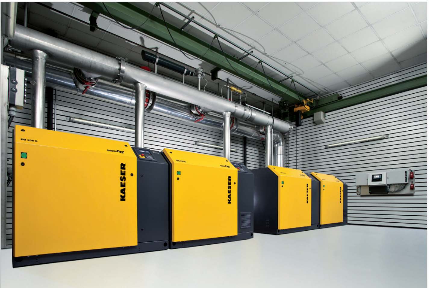
Figure 4: Multiple integrated blower packages controlled with a system master controller offer an energy-efficient and reliable solution for wastewater treatment plants.

Successful system integration begins with proper planning and careful equipment selection. When planning a rotary blower installation, it is important to consider not only the individual blowers, but also the system as a whole. It is well documented