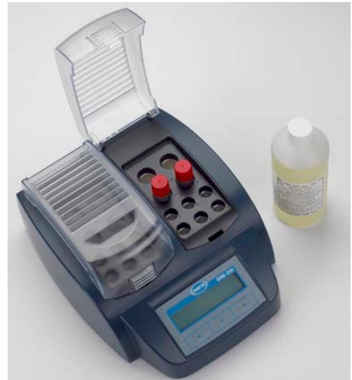
Figure 1: Combination reagent, sample/digestion vials, and digestion block