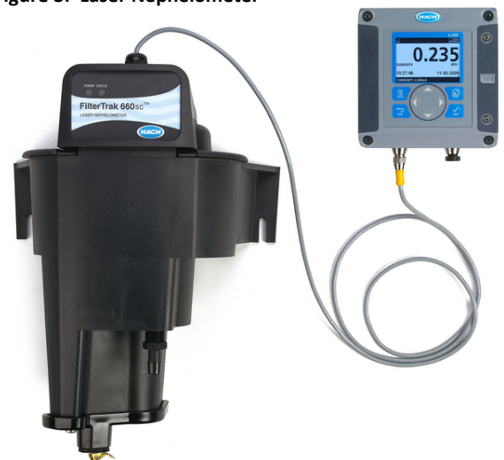
Figure 3: Laser Nephelometer