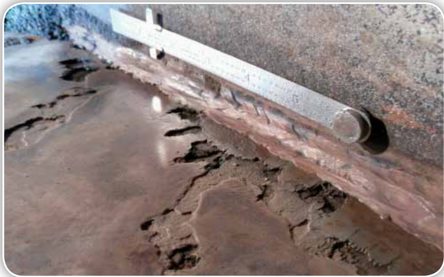
Corrosion damage at a wall and floor joint

Throughout the project, participants will meet at least twice a year as the new Corrosion in FGD Materials Interest Group to review the project status, iden-